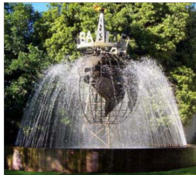
The Fountain of Faith Washing the Globe with the Word of God.

JESUSISCOMING.BIZ GODDAMNTHEDEVIL.COM THEBUSHDOCTRINE.COM EVILDOERSUCK.COM AMERICANWEBS.COM THESPEAROFDESTINY.COM GLORYOFTHESTARS.COM JACOBSPILLAR.COM HOMELANDSECURITYBILL.COM MIDEASTPEACEPLAN.COM