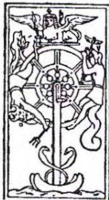
10. Wheel of Life

Those Ancient Heathens discovered that there is a Creative Cycle which has no beginning and no ending, the course of which runs as regular and certain as the rising and setting of the sun. They called it the Wheel of Life, and symbolized it in their Zodiakos and their Tarot Card No. 10, presented here. But practically all data concerning this symbolism have been lost or destroyed, and we are warned in dictionaries, histories and encyclopedias that the Zodiakos was the stupid work of Superstitious Heathens; that everything related in it and to it was foolish, deceptive, and should be discountenanced.