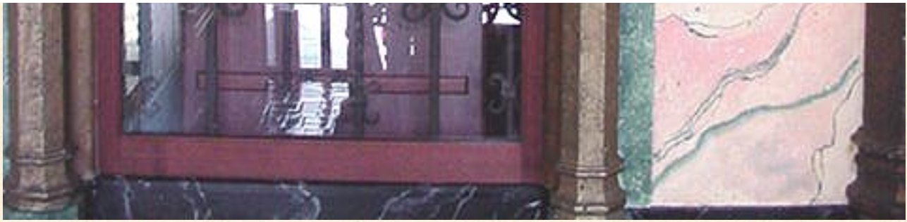
View of Station 33

The Codex Sinaiticus gets its name from the place of its discovery, the famous monastery of St. Catherine on Mount Sinai, built in the middle of the sixth century A.D. by the Emperor Justinian. In the mid-nineteenth century Constantine von Tischendorf found the manuscript, some leaves of which were in a waste-basket waiting to be burnt. He was able to take it away to Russia, and in 1855 he presented it to Czar Alexander II of Russia at St. Petersburg, where it remained until well after the Russian Revolution. In 1933, the Codex was purchased by the British Museum for the sum of 100,000 Pounds, raised largely by public appeal in Britain and America, and supplemented by a grant from the British government.