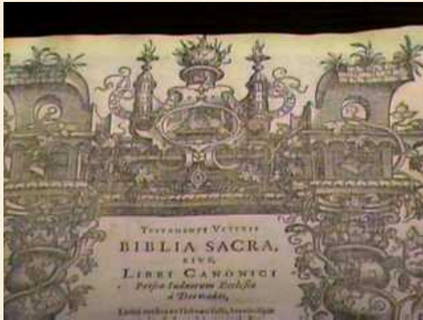
The "final" Vulgate Version