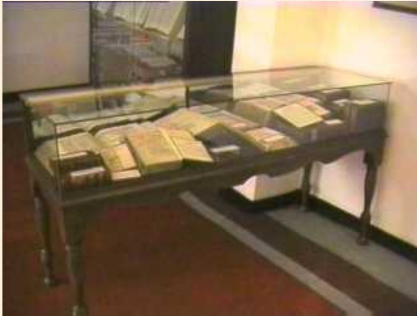
An overview of Station 9 in the "Room of the Book"

This Station shows a number of 16th through 19th Century Bibles, including, among others: