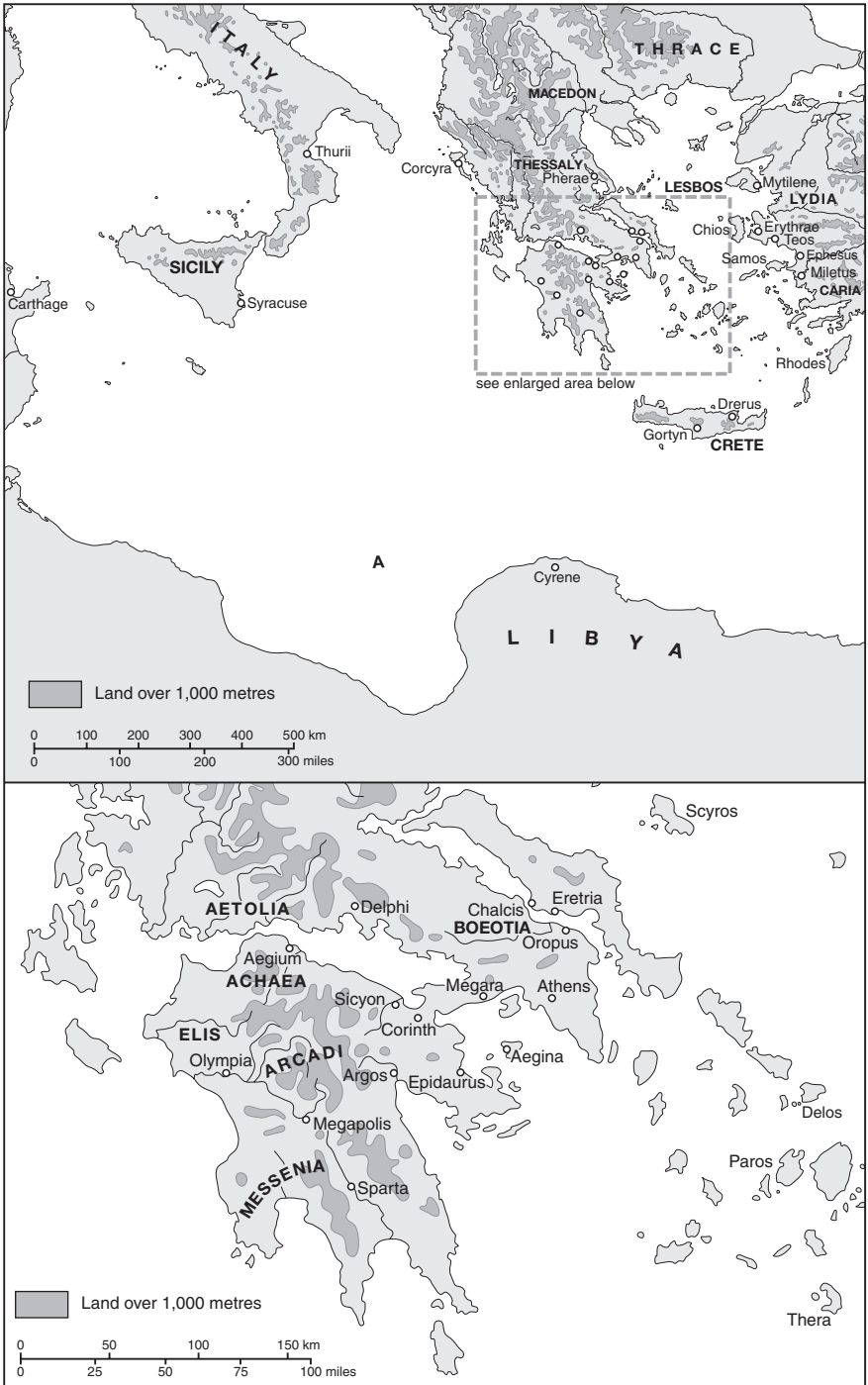
Map 1 The Greek World.