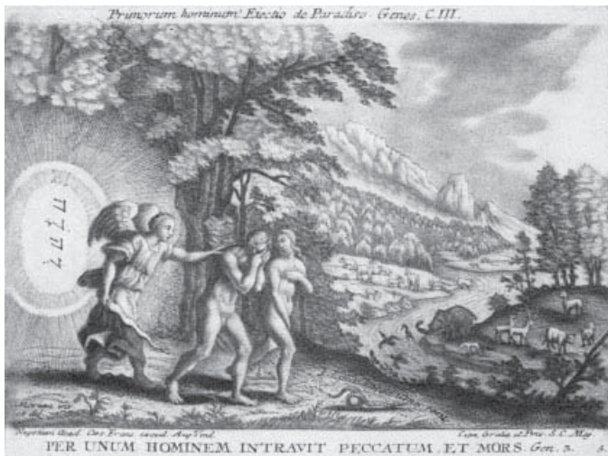
The Expulsion from Eden , seventeenth-century engraving.

The Genesis account of the expulsion of Adam and Eve from Eden seems to have a clear note of finality stamped upon it. “At the east of the garden of Eden [God] placed