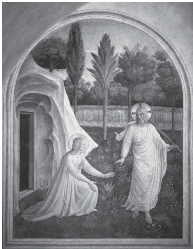
Fra Angelico, Noli Me Tangere , 1425–30, fresco, Convent of San Marco, Florence.