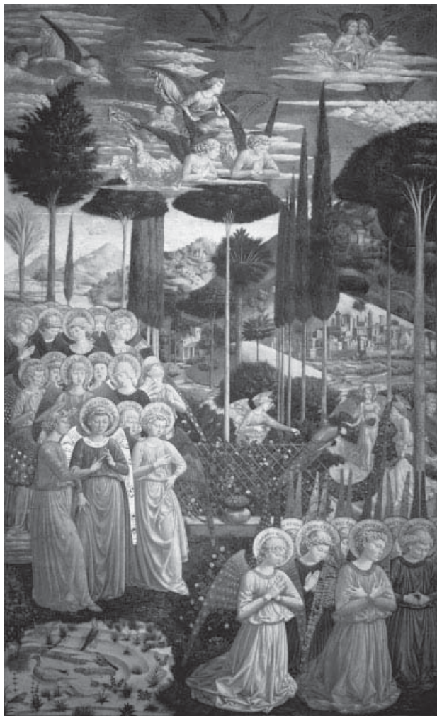
Benozzo Gozzoli, Angels Worshipping , fresco, Palazzo Medici Riccardi, Florence.