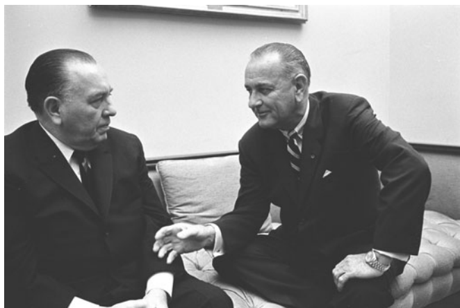
6. President Lyndon Johnson pays homage to Chicago's longtime political boss, Mayor Richard Daley.

Parties, however, did not disappear. If parties as campaign organizations were on the wane, parties as a means to organize the government and as a symbol to which citizens showed loyalty remained strong. 8 In the early twentieth century both parties, in both houses of Congress, began to elect formal leaders, whether the party held majority or minority status. Party members in legislatures were expected to follow their leaders. The party of the president was expected to support that president's legislative program. Newly elected presidents routinely chose members of their own party to fill cabinet and subcabinet jobs.