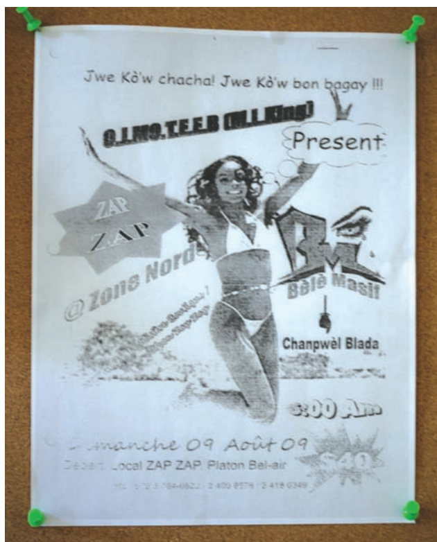
Figure 3. Beach day flyer, 2009.

flyer designed by Michel (see figure 3). It pictured a young, attractive girl in a white bikini, jumping enthusiastically, her long locks bouncing around a caramel-colored face. “ Chacha [dance] your body, romp your body, good thing!” Around this image radiated the architecture of the base; the titles of the various groups appeared in graphic displays, with the names of the sponsors, Yves and Mystère Boutique, in finer print. The Ministry of Sport and Youth, as well as the NGO Viva Rio, were also solicited in writing, and the former was added to the placard after issuing a check for about fifty dollars. Both the flyer and the placard advertised the ticket price (about $5) that would be printed on raffle tickets and distributed to attendees. This proved a prohibitive cost for most. In fact, it was largely an empty performance of economic agency, since the organizers gave most attendees complimentary tickets. Nonetheless, the performance delivered a real social good, constructing the organizers and beachgoers as possessing the economic and social capital of bona fide men. The placard even announced, “You must work hard for the ticket, or else you’ll be ashamed!”