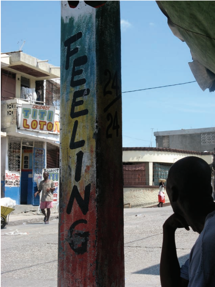
Figure 1. Bel Air streetscape.

brightly painted poster announced the annual beach day of Martin Luther King, one of the area's male cliques ( staff ). Though standing where two friends had died under a collapsed house, the poster and its message eschewed grief. Chiding trash-talkers and the penniless, and welcoming the displaced, it read: "This year MLK brings the stuff. . . . Pay money so you can do it. We await all new, pretty ladies in the zone, all my new brothers. . . . We await all at Baz ZapZap. Those with big mouths, stay home!"