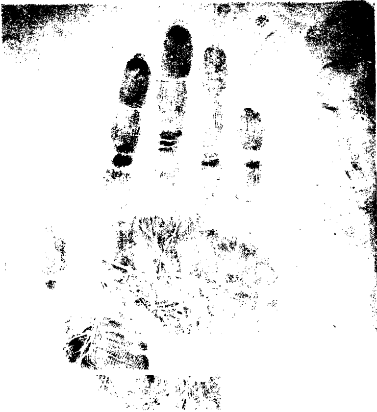
NAWAB SALAR JING BAHADUR

No. 12. The palm of an unmarried lady, heiress to landed properties. Note the separation of the line of action from the line of feeling, producing obstinacy and impetuosity and encouraging wrong decisions. Ladies' palms are in general of the Feeling-Type, though willing types are by no means rare. Note the triangle of affluence in the plain of Mars attached to the fate line which forms the sign of the square through which the line of action passes.