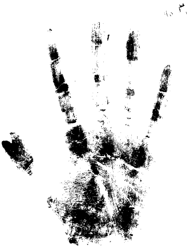
No. 22. The palm of a widow with ten crores of rupees. Her husband committed suicide. Note the influence of the tragedy in the line crossing the triangle of Earth.