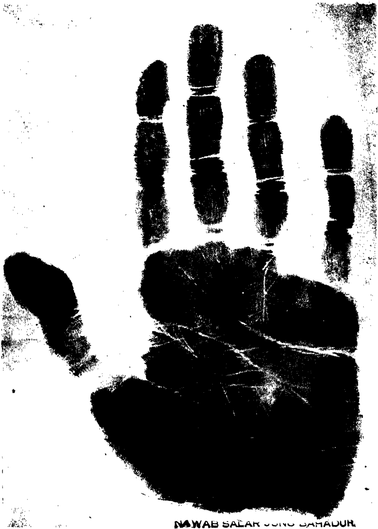
NAWAB SALAR JUNG SAHADUR.

No. 18. The palm of a Bombay multi-millionaire. Death of the wife is indicated by the diagonal line on the border-land between Neptune and Venus. The effects of drinking and nervous strain are seen in the up-ward off-shoots from the Line of Action and the horizontal cuts along the triangle of Earth.