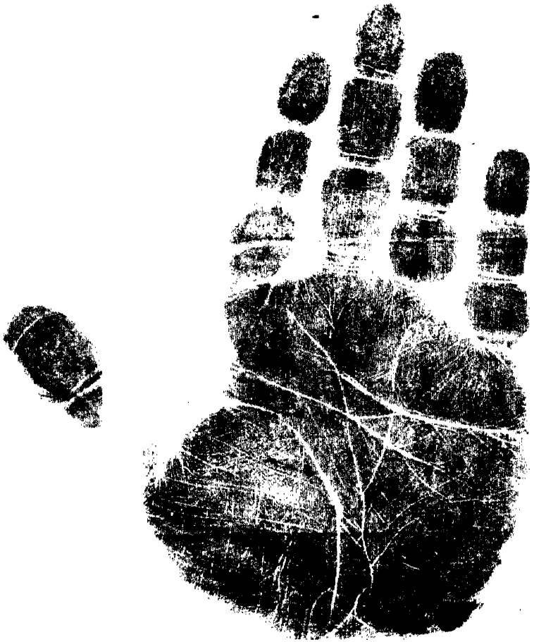
No. 9. The palm of Mr. Tulsi Chatterjee of S-B, Bhabanath Sen Street. Note the triangle of income in the plain of Mars and the sign of the tree in the mount of Apollo (Sun). The thumb is non-flexible, touch soft and zones well-developed. Type—Willing-Feeling.