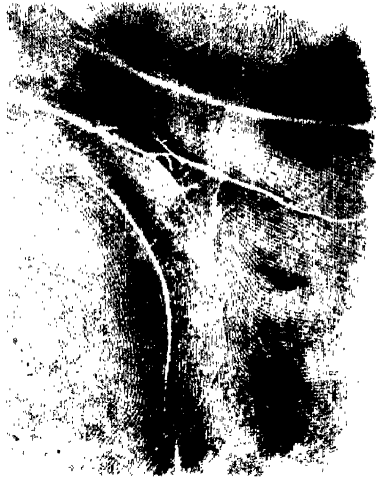
NAWAB SALAR JUNG BAHADUR

No. 13. The palm of Seth Chaturvuj Gandhi, a cotton magnate of Bombay—a master of a crore from trade with a small capital. See the absence of a marked fate line, the sign of the bow in the triangle of Earth, the well-developed zones, and the sign of a big, clear island joining the line of Mars with the line of Action.