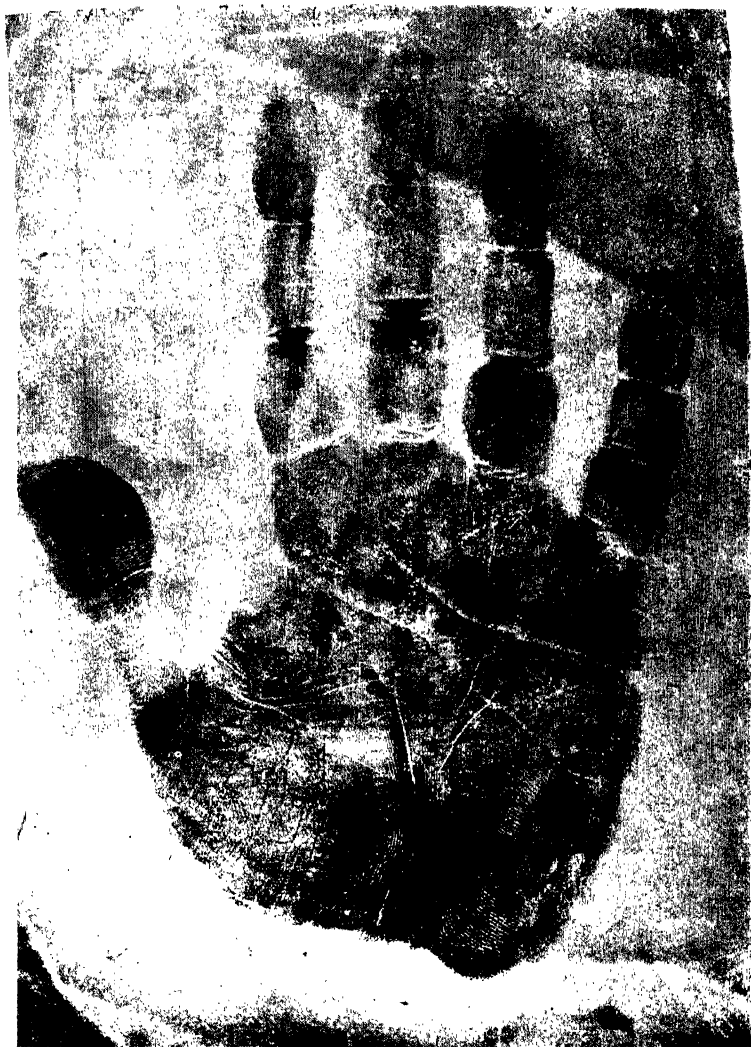
No. 15. The palm (Willing-Type) of a Parsee professor. See the sign of disappointment in matters of affection.