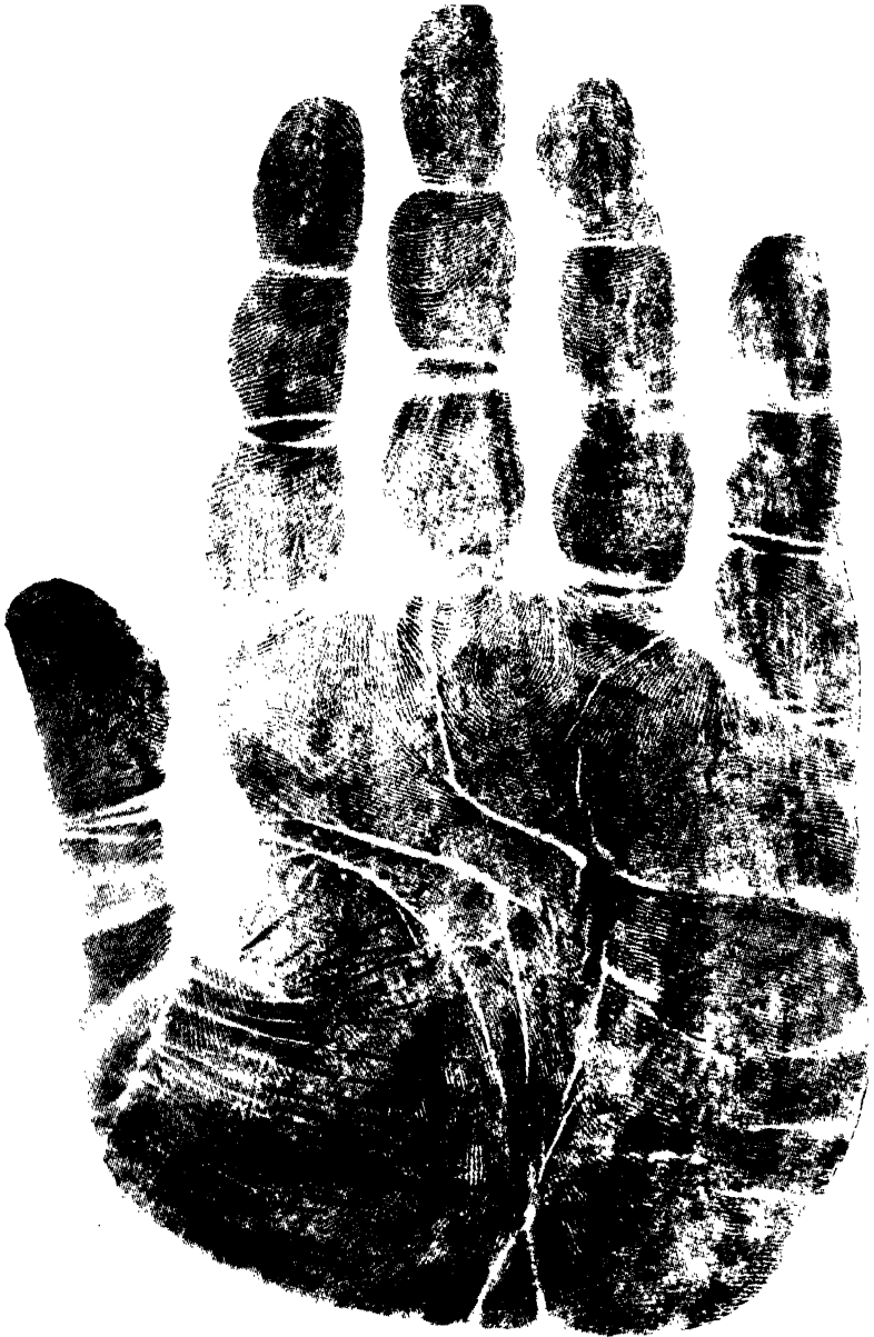
No. 20. The palm of the son of a multi-millionaire. Loss of wealth may be anticipated from the Lines of Sun and Fate. Note the lines of opposition in Neptune and Venus. The thumb is of the non flexible type. Jupiter is abnormally high. The