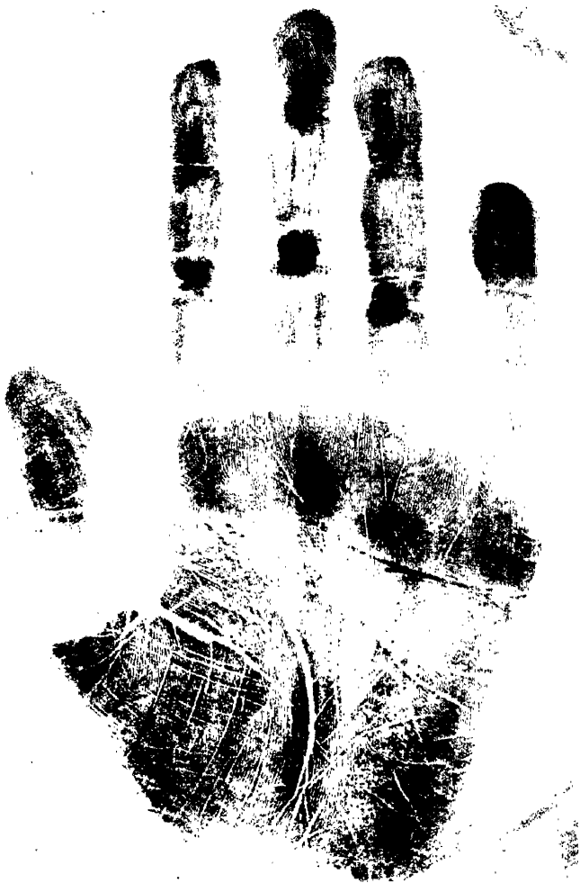
No. 7. The palm of a romantic lady married to a prince. See the conflict of emotions all over the palm. Type—Feeling-soft touch.