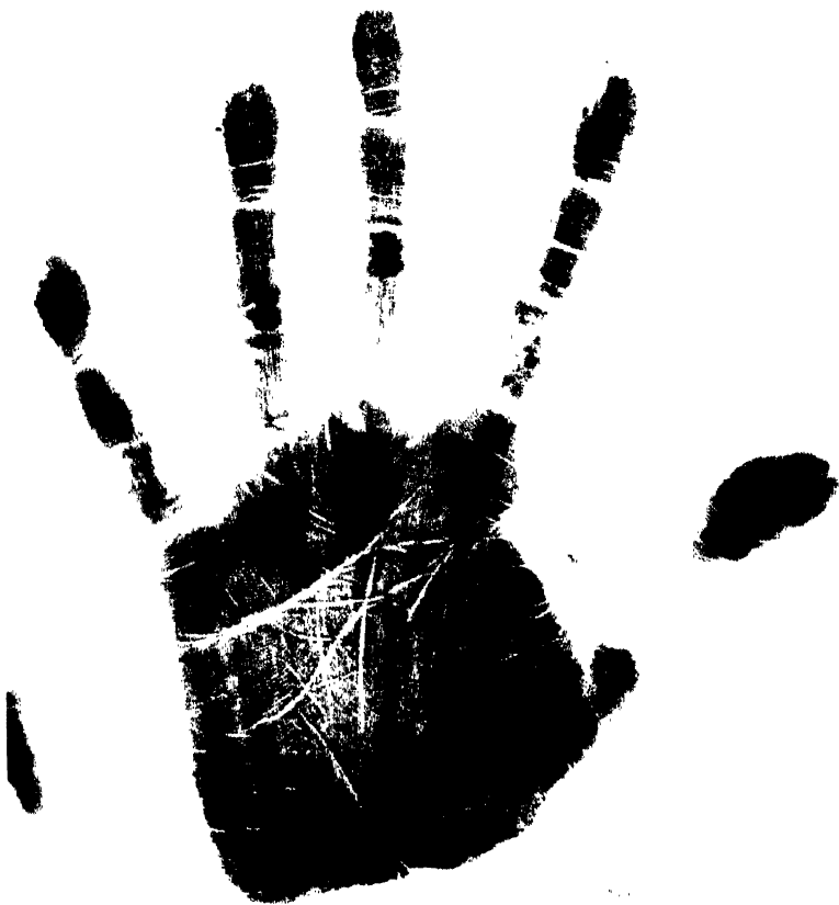
No. 8. The palm of a multi-millionaire of Bangalore. Type—Feeling.