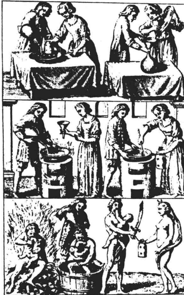
Processes of the Great Work.