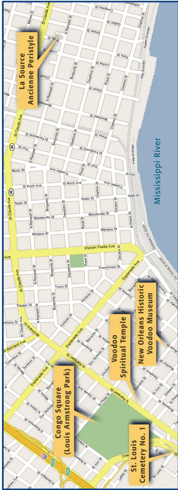
Figure 1 Locations of sites studied in New Orleans