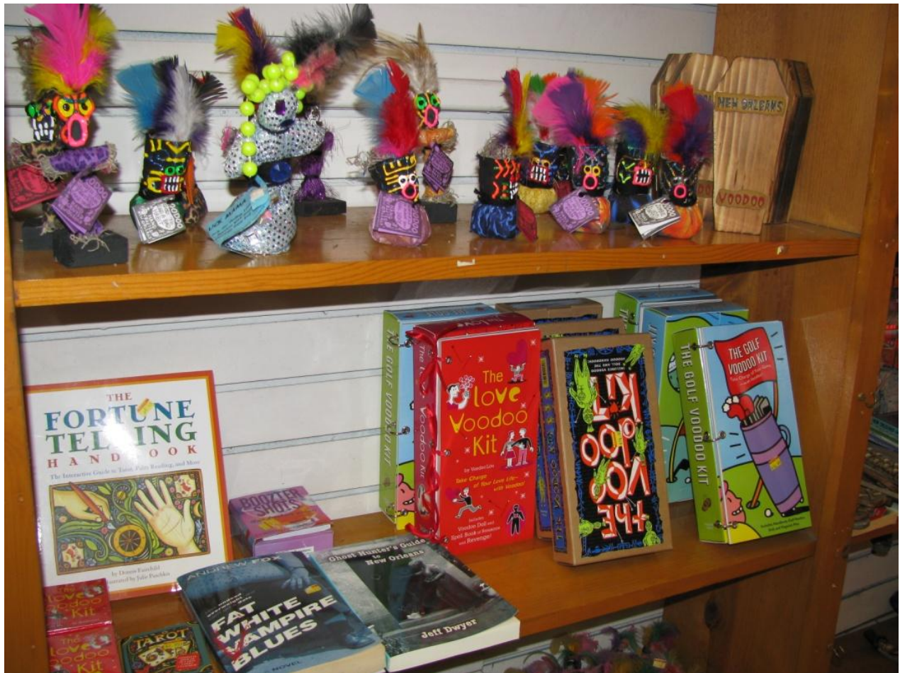
Figure 4 Vodou dolls at a New Orleans tourist shop. Notice the other items such as tarot cards, kits and a souvenir coffin. February 4, 2008.

According to Jerry Gandolfo, Manbo Sallie Ann , Vodou dolls are not part of the practice of Vodou despite their popularity in tourist shops. They told me that Vodou dolls are actually of a European origin and those that do make a likeness of a person for ritual use do so for positive, not negative, reasons. Researchers such as Wendel Craker (1997) have indeed documented the use of poppets (dolls) for ritual use in European witchcraft practices in America. In addition, while magical practices in some West African cultures such as the Yoruba do use human figures (Wolff 2000), in my own research I never encountered a person who claimed to be a Vodouist