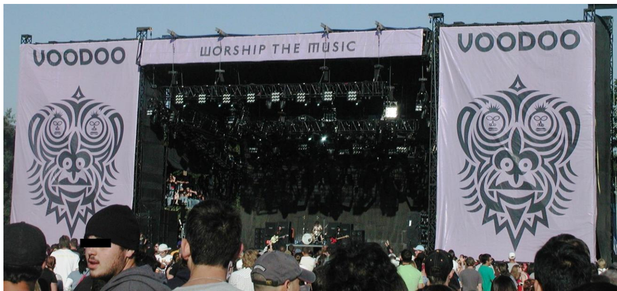
Figure 3 Voodoo Music Experience: Voodoo Stage. The band Fallout Boy is playing to a large crowd at this outdoor music festival.

the relationship ends there. For example, a popular restaurant in New Orleans (and other Louisiana cities) is Voodoo BBQ & Grill. Their menu includes items like Gris-gris Greens, the Voodoo Burger and the Graveyard Platter alongside more common names for barbecue dishes. The restaurant menu and website, however, claim only to be authentic New Orleans style barbecue and have no mention of magic or religion. Another example is The New Orleans Voodoo, the city's arena football team. The arena the team plays in has been nicknamed "The Graveyard," the cheerleaders are called the "Voodoo Dolls" and the two team mascots are named "Mojo" and "Bones." Mojo is a word meaning a magic spell or charm though the mascot is a yellow and purple furry creature that wears a team jersey. Bones is a skeleton with a tuxedo jacket, a top hat and sunglasses – an image taken from Haitian Vodou spirit Baron Samedi . This image of the Baron also shows up in the team logo, which is a skull in a top hat with sunglasses. Yet the arena football team claims no relationship to the religion.