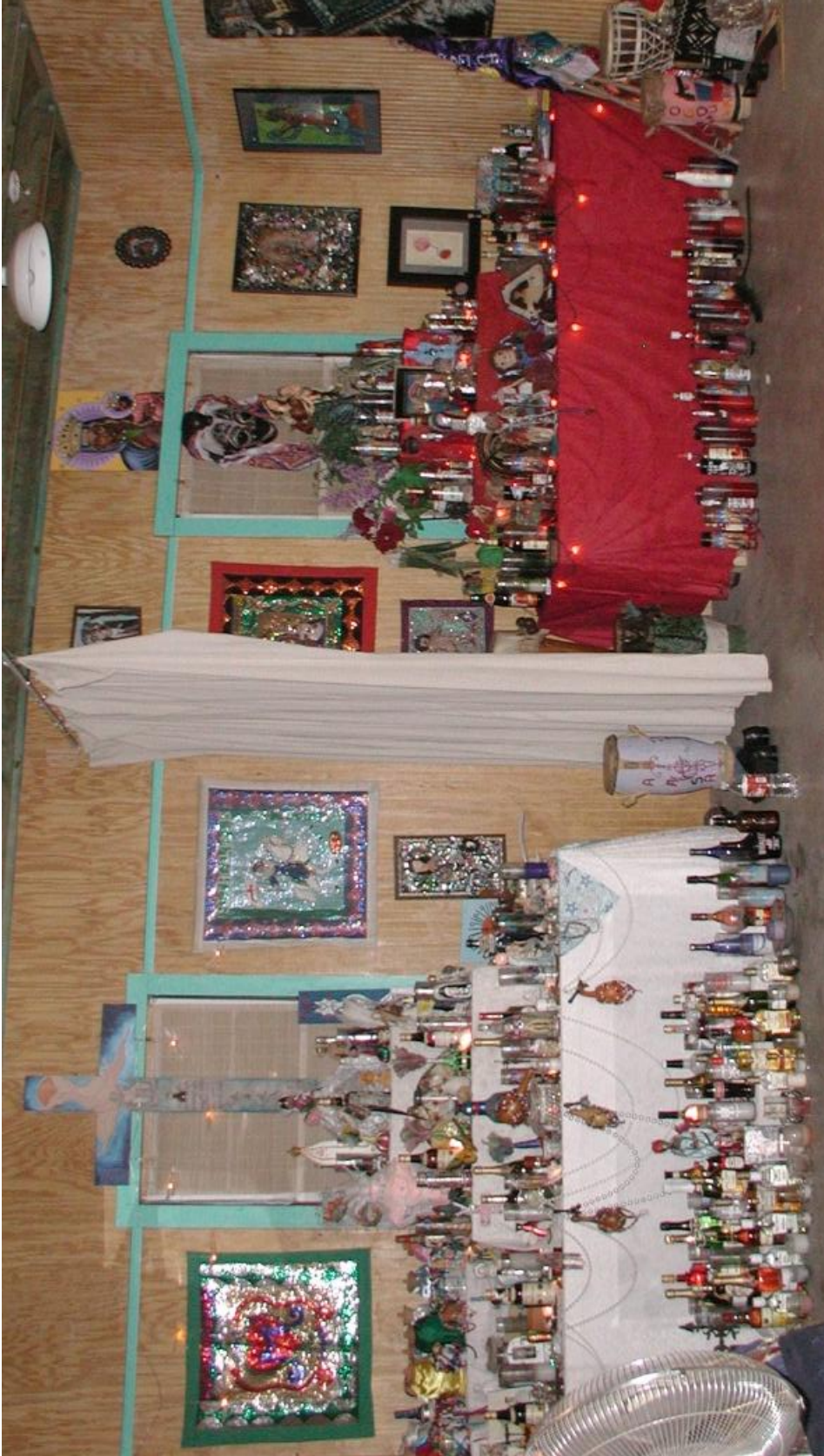
Figure 13 Petro and Rada altars. Lasiren is to the left and Gede to the right of the photograph.