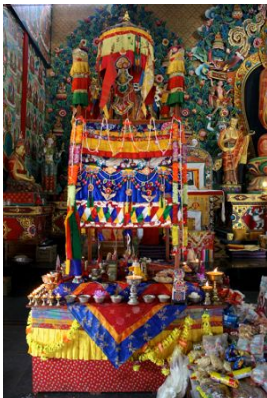
The empowerment shrine after practice

The shrine room was a lonelier place with 30 Western guests gone after the Dzogchen Retreat. About the same number of Westerners remained, but more were scheduled to depart in the coming weeks. On the bright side, there was a bit more space for everyone and it was easier to get a seat close to the front of the room. Today I sat in the front row of Westerners for the first time, about eight feet from the huge empowerment shrine.