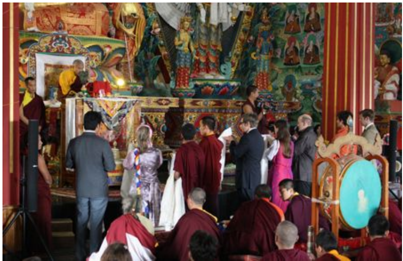
Offerings to His Eminence at the end of the Dzogchen Retreat

things dualistically, which is the source of the rest of our suffering. In contrast to this is an unbiased perspective, the view of purity and equality that is pointed out by and embodied in the mahayoga practices. When we recognize and have ongoing confidence in the vision of ourselves and the world that is presented through the mahayoga practices, this radiates out into