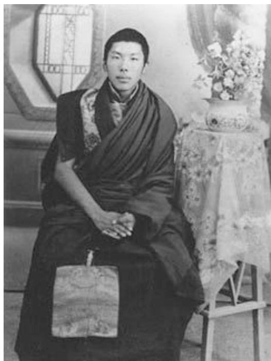
Chögyam Trungpa Rinpoche in Tibet

Until starting research a few months before my arrival in Orissa, most of what I knew about the Rinchen Terdzö came from Born In Tibet , Chögyam Trungpa Rinpoche's account of his life in Tibet and escape to India. Descriptions of the Rinchen Terdzö take up many pages in the chapters dedicated to the Vidyadhara's education and early adulthood. Along with being eager to learn more about the mind and training of the Vidyadhara, I was excited to go to India to experience the Rinchen Terdzö myself and understand its importance to Sakyong Mipham Rinpoche and Shambhala.