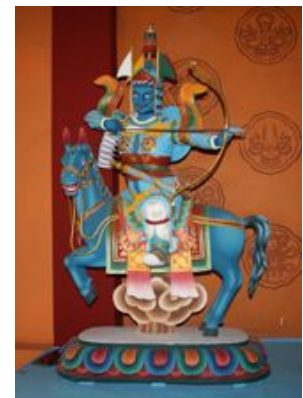
Gesar's minister, Denma