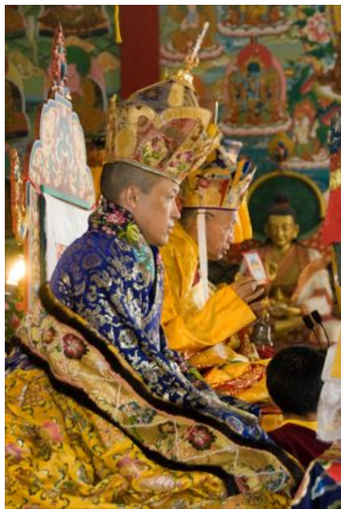
The Kongma Sakyong Mipham Rinpoche