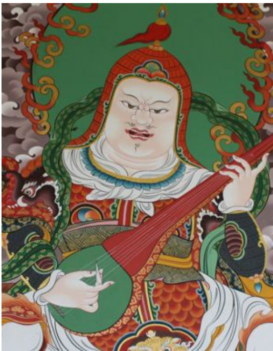
Dhritarashtra, the Great King of the East

Today we continued the empowerments for the auxiliary sadhanas related to various ordinary activities, the enlightened activities of awakened mind in this world. One series of empowerments was for a group of deities called the Four Kings. This empowerment was part of the section of empowerments related to the activity of protecting a region.