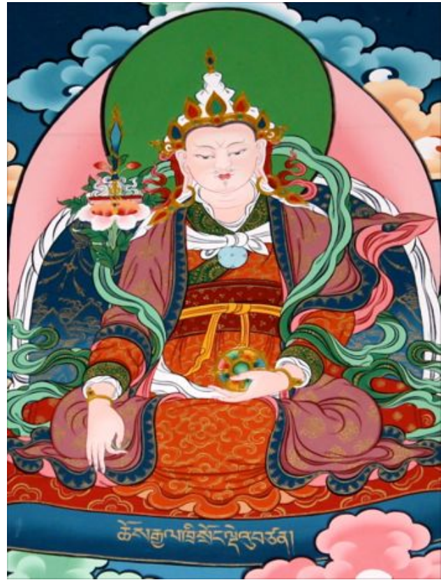
King Trisong Detsen

An ongoing contemplation during and after the events in Orissa was the relationship between the Rinchen Terdzö, sovereignty, and enlightened culture. While the Rinchen Terdzö can be seen simply as a treasury of amazing practices, looking at the collection in the context of the development of Buddhist culture in India and Tibet sheds light on how the vajrayana is transmitted both in the tantric tradition in general and in Shambhala. For the most part, although there was occasional royal patronage of the dharma in India, a stable vajrayana Buddhist kingdom never arose there the way it did in Tibet. Once a genuine vajrayana culture was established through the support of a royal lineage in Tibet, it paved the way for incredible growth of Buddhist lineage, practice, and scholarship. Padmasambhava's activities in Tibet, and the eleven centuries of Tibetan termas highlighted by the Rinchen Terdzö, would not have arisen without the vision and example of King Trisong Detsen.