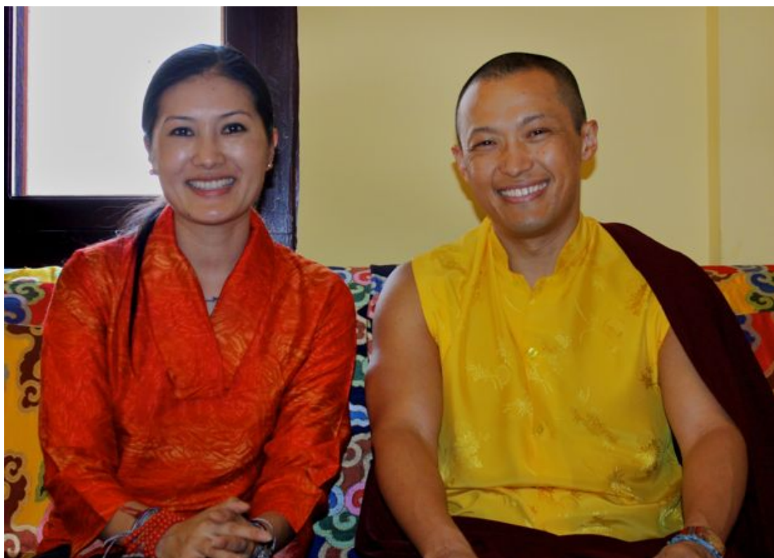
The Sakyong and Sakyong Wangmo fifteen minutes after the final empowerments.