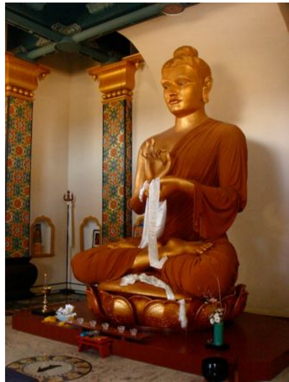
The Buddha, first level of The Great Stupa

The second floor of the stupa houses a three-dimensional representation of the mandala of Chakrasamvara, one of the main yidams of the Sarma or New Ones, the Buddhist traditions that arrived in Tibet after the Nyingma or Early Ones. Chakrasamvara is a major practice of the Kagyü lineage, the Sarma practice tradition that Chögyam Trungpa Rinpoche upheld along with the Nyingma. It is also one of most important practice traditions maintained at Surmang Dütsi Til, Chögyam Trungpa Rinpoche's home monastery in Tibet. The second floor of the great stupa represents the Sarma traditions as well as the sambhogakaya aspect of buddhahood, the radiant display of the mind of wisdom. The difference between this and the first floor of the stupa is that the sambhogakaya is related with mind's energetic display rather than something visible in everyday life. The sambhogakaya is experienced through meditative realization, whereas a nirmanakaya—the form of a Buddha, a statue, or a realized teacher—is perceivable in the everyday world.