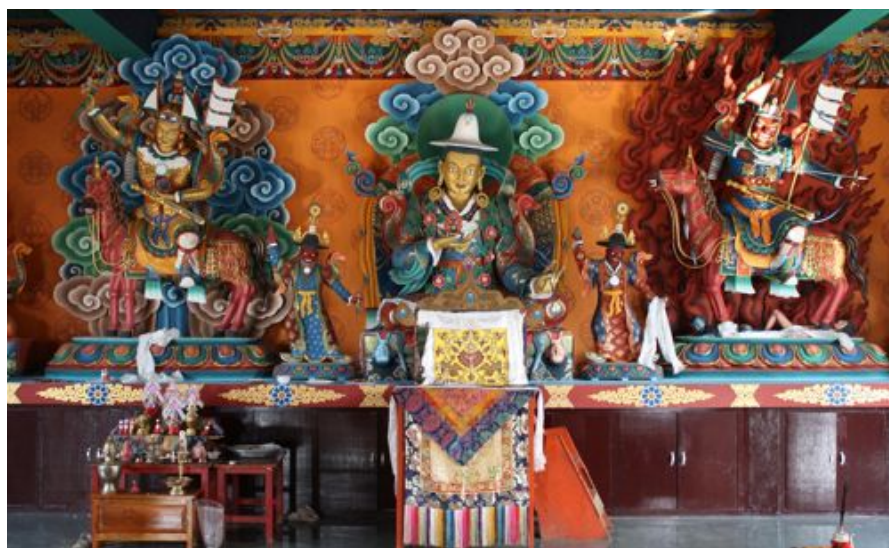
Gesar Shrine Room

bamboo poles and rebar to go the upper deck of the monastery in order to build scaffolding and do the finishing work necessary for the sertok . Sertok are golden roof ornaments that attract wealth and beautify a building like a monastery. There are sertok on the roof of the Boulder Shambhala Center. The formal