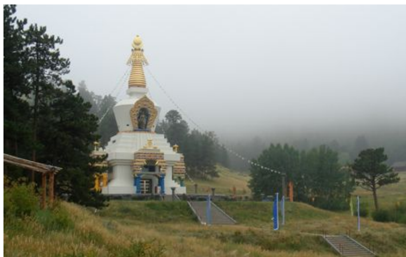
The Great Stupa Of Dharmakaya

buddha. This is one reason why seeing a stupa can be profound and liberating.