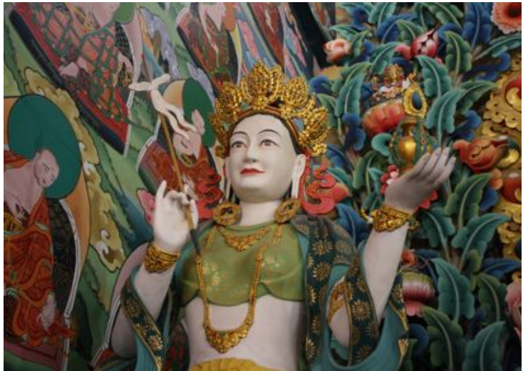
Mandarava, Padmasambhava's Indian consort