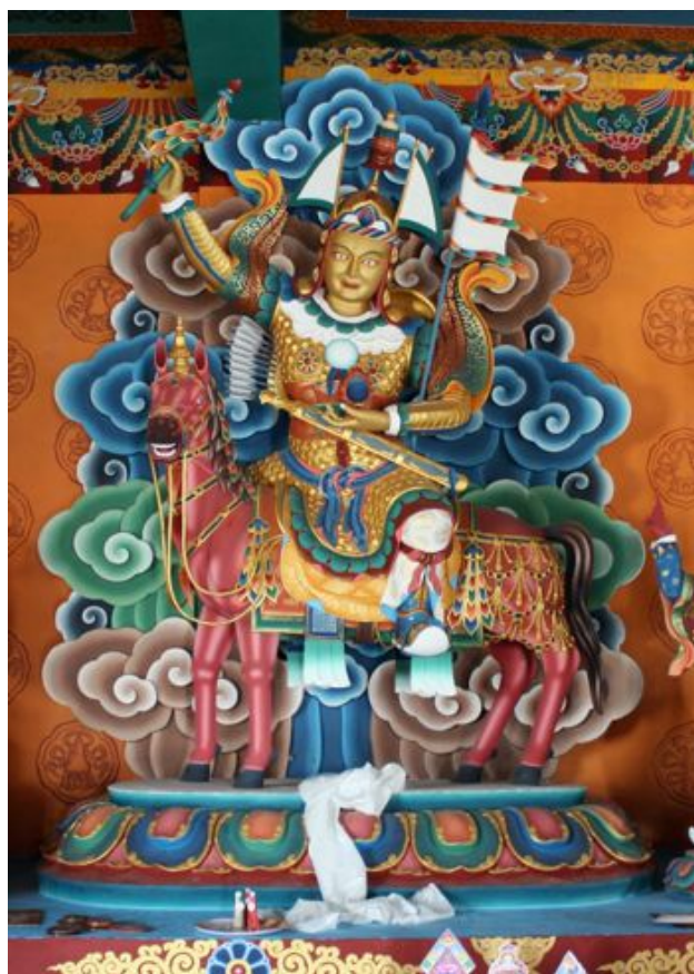
Gesar in the aspect of a drala, from the Gesar shrine room in Orissa, India

sangha, to ensure the survival of the dharma in this world. He established a family lineage in the center of a dharmic society in order to preserve the vajrayana tradition in a modern context. We often say that Chögyam Trungpa Rinpoche brought the dharma to the West, but we can also say he created a world, a culture, and a context for the dharma to land when it came from the East.