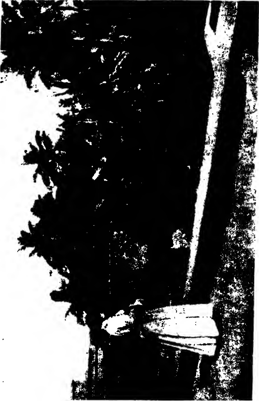
ON THE ROOF