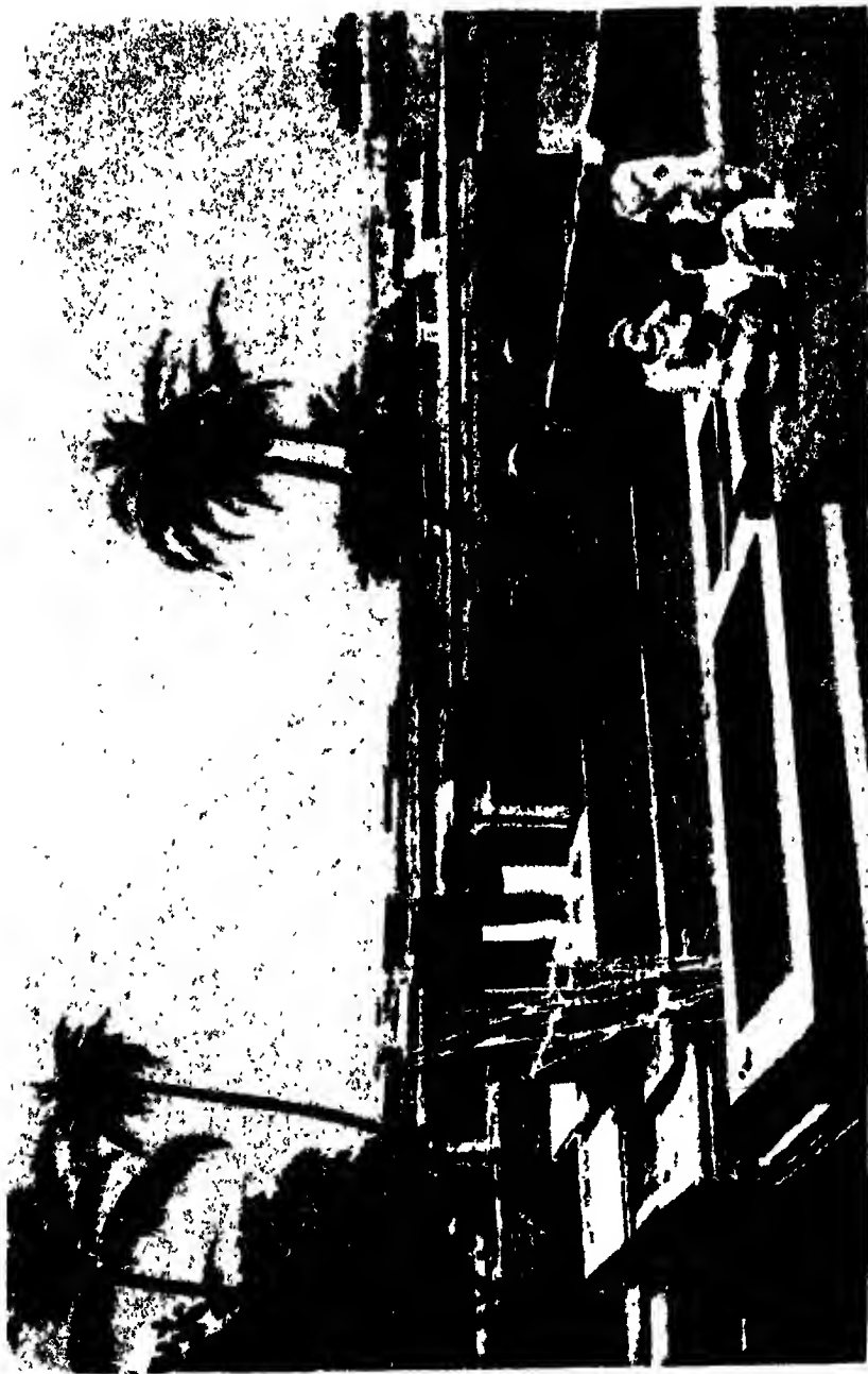
ON THE TERRACE