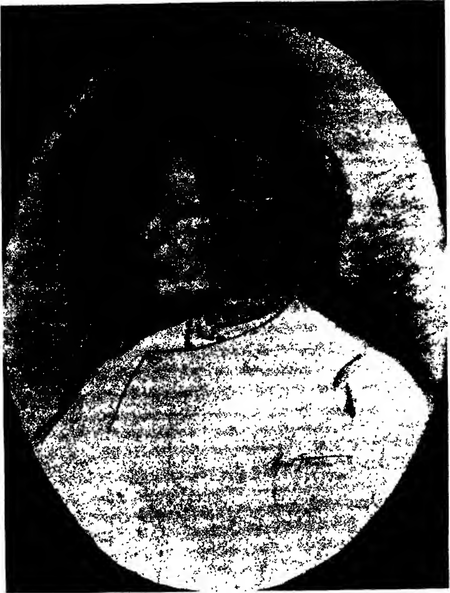
A PENCIL SKETCH OF SISTER NIVEDITA