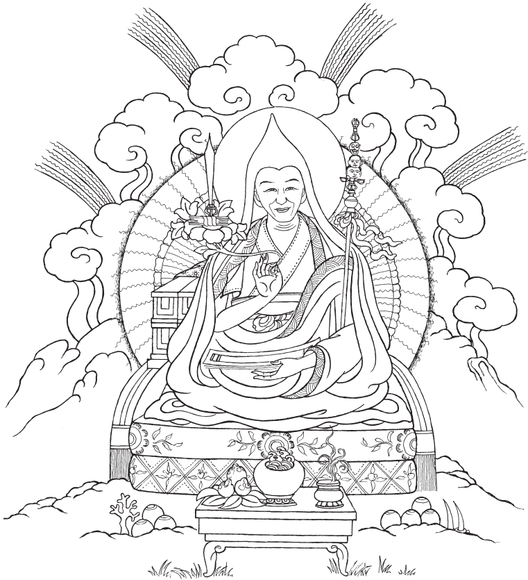
Kyabje Trijang Rinpoche