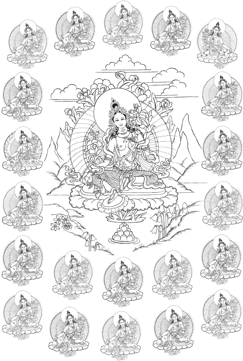
The Twenty-one Taras