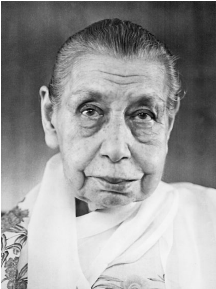
The Mother in 1970