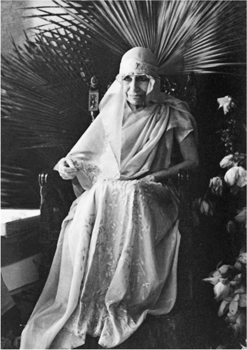
The Mother Kali Puja, 10 November 1958