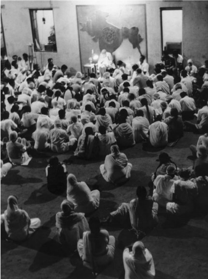
The Mother taking a class at the Playground, 1954