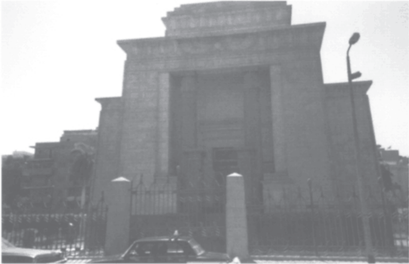
Figure 11.3 Mausoleum of Saad Zaghloul, Cairo

modern Egypt. The memories of Saad Zaghloul and Moustafa Kamil were overlooked. The political discourse that centered on Pharaonic Egypt was replaced with a discourse that placed Egypt within the folds of Arab nationalism.