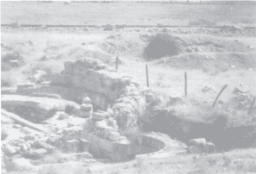
Figure 1.2 Archaeological site at Soloi, classical period: pipeline (conduits) running through site (Courtesy: Director of the Department of Antiquities, Cyprus)

Source: P.S.O'Keefe and L.V.Prott (1989) Law and the Cultural Heritage , Vol. 3, London: Butterworths.