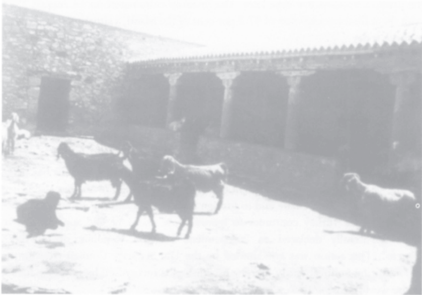
Figure 1.1 Monastery at Tochni, Famagusta district: destroyed and used as a sheepfold

The destruction of archaeological sites (see Figure 1.2) and the illicit trade of antiquities in the northern part of Cyprus has had dramatic and likely irreversible consequences, both for Cyprus’ cultural heritage and for archaeological research on the island. Documents from the Turkish Cypriot (Yasin 1982) and foreign