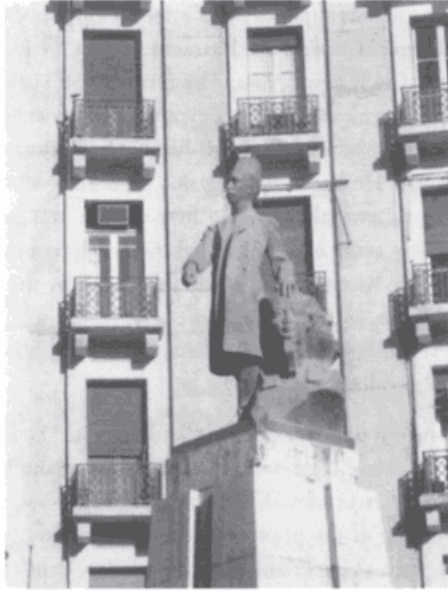
Figure 11.1 The statue of Moustafa Kamil in downtown Cairo

The unification of Copts and Moslems, of men and women, of workers, peasants and bourgeoisie was legitimated by an appeal to “eternal Egypt,” “young Egypt” and, above all, Pharaonic Egypt. Poets such as Ahmed Shawki, Hafez Ibrahim, Ismail Sabry and Al-Baroudi began to invoke the pyramids in a genre of nationalistic poetry comparing Egypt’s past glory with its impoverished present and extolling the Egyptians to restore and revive Egypt’s ancient splendour and hegemony. Historical plays by Ahmed Shawki, the prince of poets, also invoked the Pharaonic heritage of Egypt as in his renowned work, Cleopatra , which became a favourite as a school play.