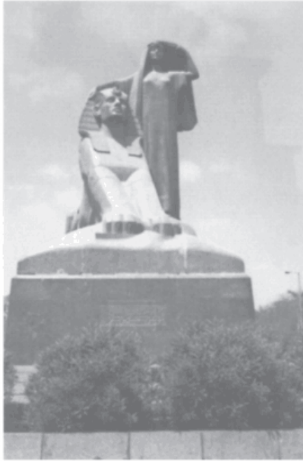
Figure 11.2 Statue of the “Renaissance of Egypt” (Nahdet Misr)