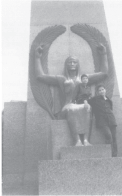
Figure 11.4 “Mother Egypt”, the pedestal of the statue of Saad Zaghloul in Alexandria, Mahtet el-Raml

Many Egyptians were swept up by the rhetoric of Arabism. For the young generations of Egyptians born after the revolution (1952) in the late 1950s and early 1960s, Egypt as Pharaonic Egypt was plotted out. However, identification with Arabism has never really penetrated the Egyptian “soul” remaining an official line especially because: (1) the Egyptians rarely trusted governments; (2) Abdel-Nasser’s popularity was a result of his image as an antagonist of imperialism and corruption and not as a head of a government; (3) his policy of repression created a sense of fear and mistrust; (4) his denial of Egypt’s nationalist history was disdained by the older generation (then in their forties to sixties, who were children or youths at the time of the 1919 revolt); (5) Egyptians use the word “Arab” to refer to Bedouin nomads or the inhabitants of the Arabian Peninsula; and (6) because Arab unity has never materialised due to rivalries, feuds, disputes and conflicts among “Arab” leaders, who were constantly creating barrages of verbal abuse on the air waves. Egypt under Nasser was also embroiled in a war in Yemen opposed by Saudi Arabia.