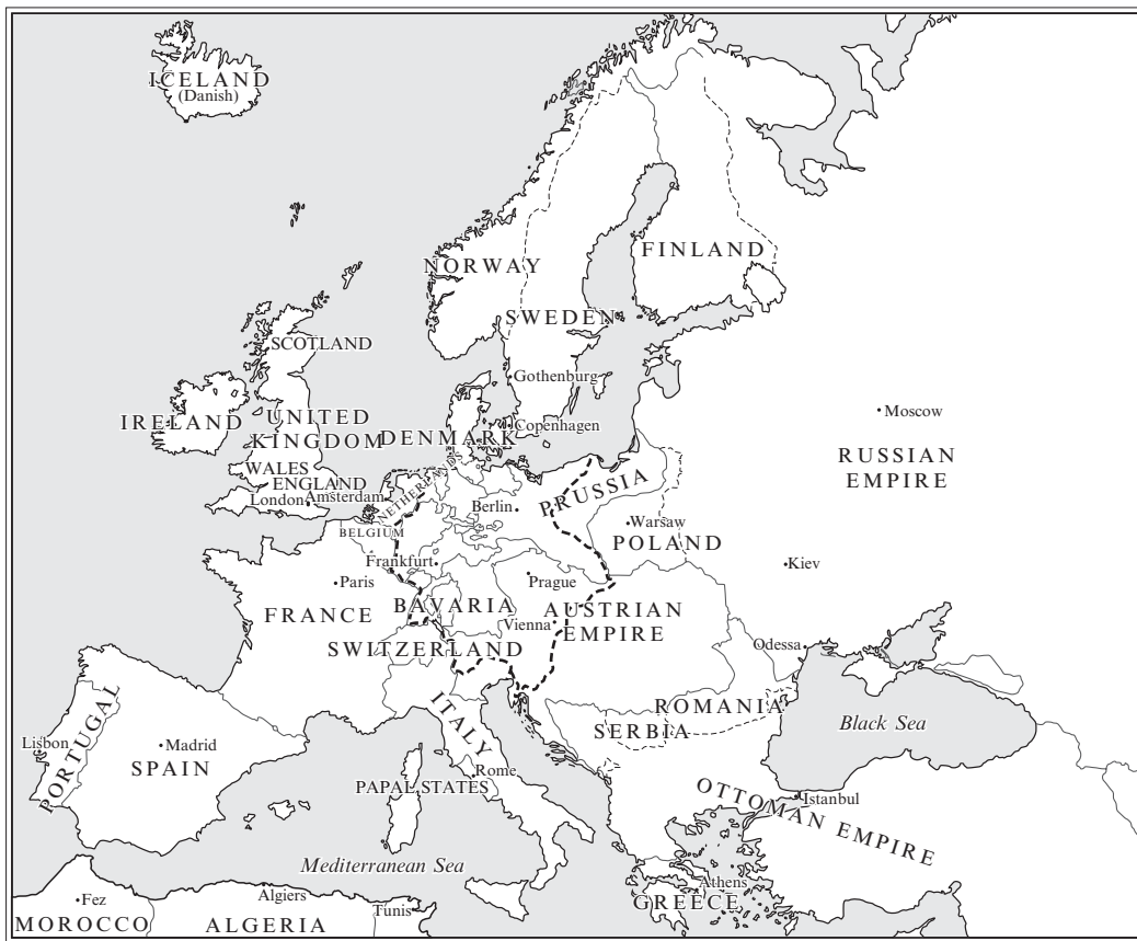
Map 5 Map of Europe in 1861 (based on The Times Atlas 1994: 156–7). The grey line encloses the German confederation