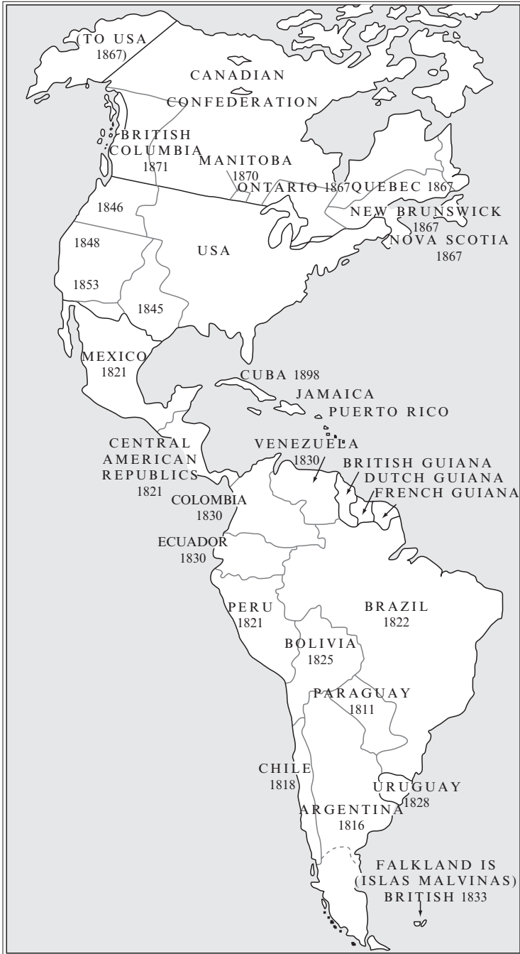
Map 1 Nineteenth-century America (based on Barraclough 1992: 101)