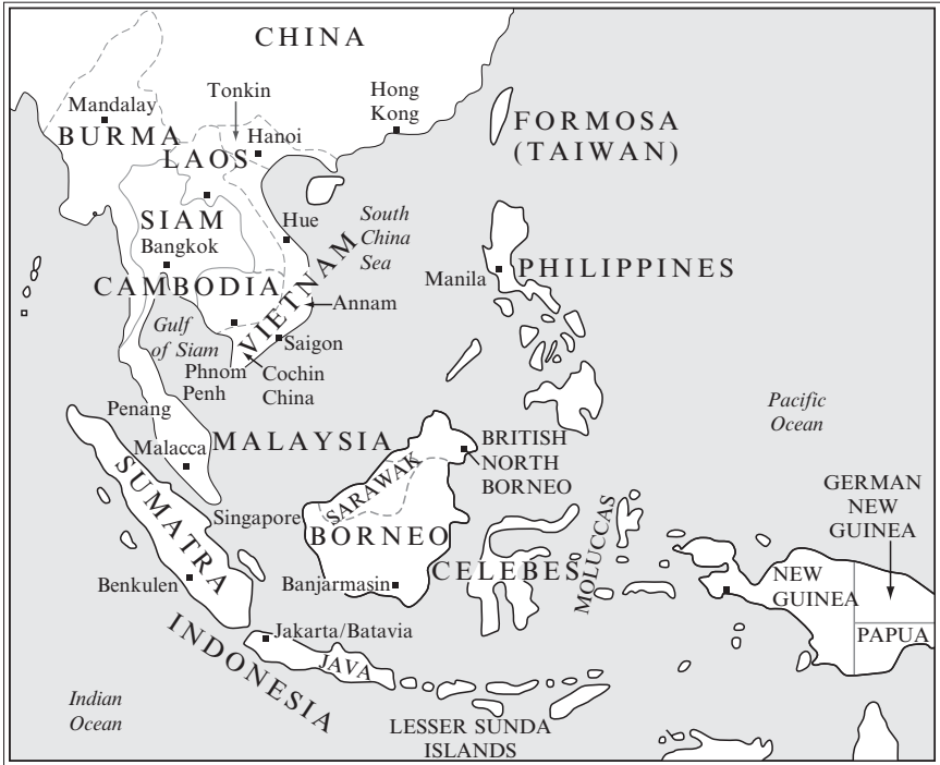
Map 3 Nineteenth-century Southeast Asia (based on Dixon 1991: map 1.1)