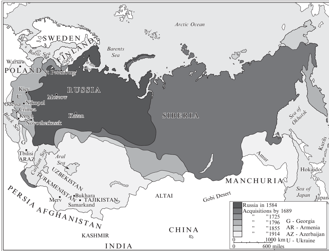
Map 4 The Russian Empire (based on Moore 1981: 70)