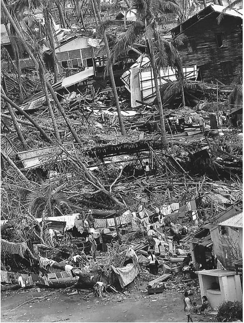
Damage from Cyclone Nargis on Haing Gyi Island, in the Irrawaddy division of southwest Myanmar, May 7, 2008.