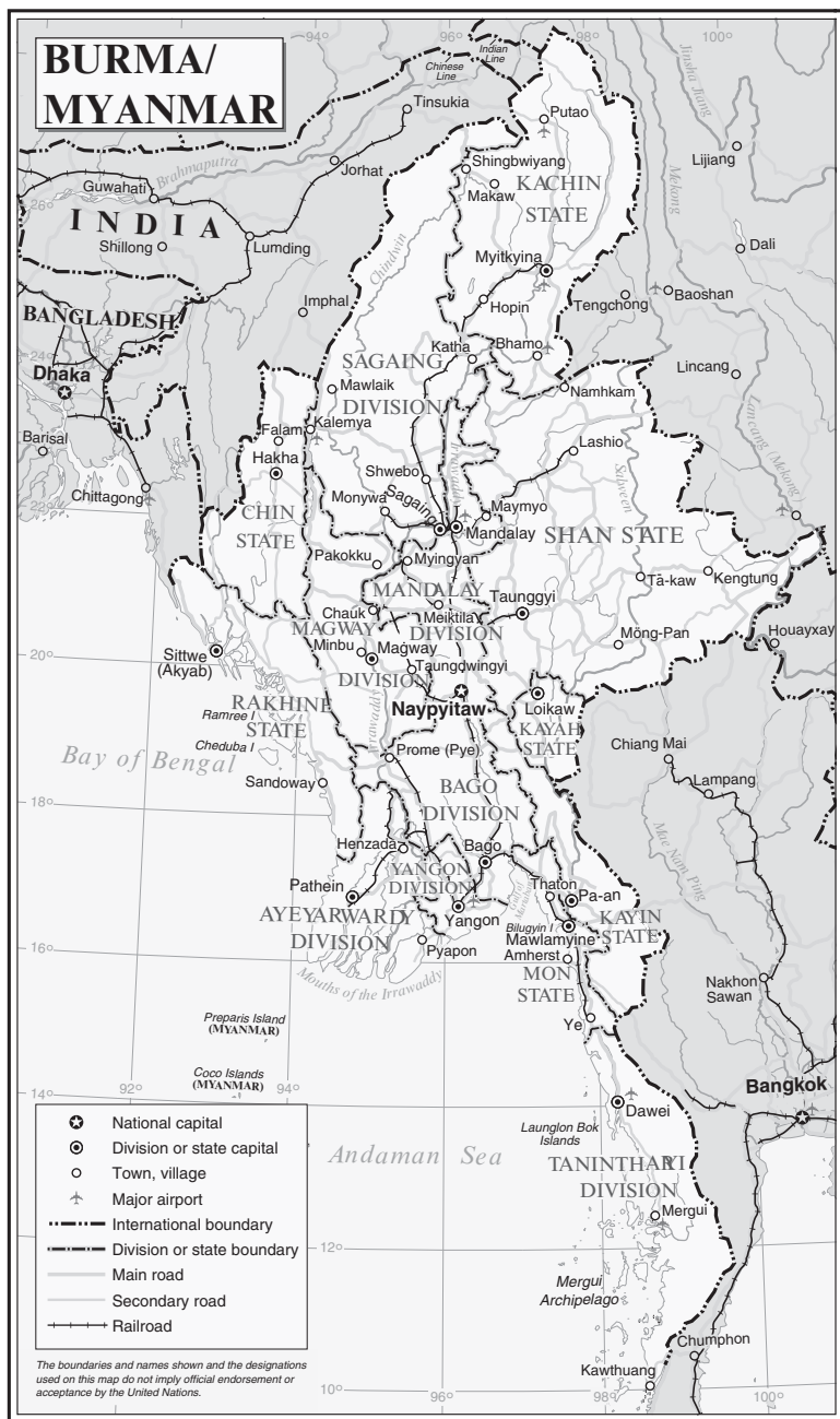
Map No 4188 Rev 2 UNITED NATIONS May 2008

Administrative divisions of Burma/Myanmar (redrawn from a map produced by the United Nations in 2008)