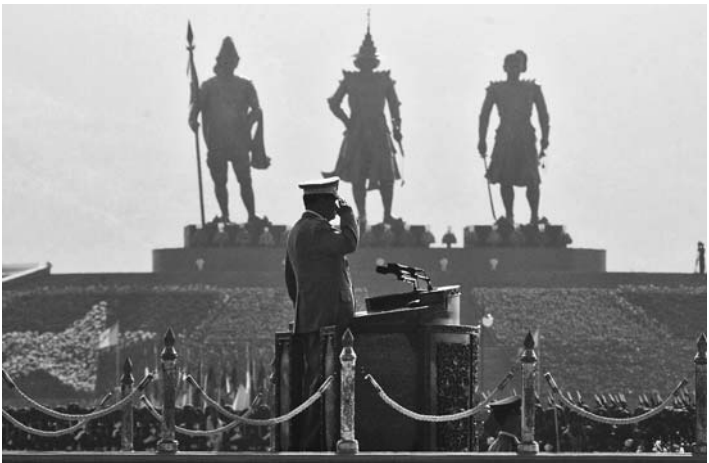
Than Shwe salutes during the 63rd Armed Forces Day in administrative capital Naypyidaw on March 27, 2008.