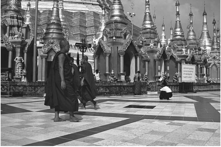
The Shwedagon Pagoda in Yangon.