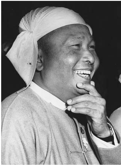
U Nu, or Thakin Nu, the Burmese prime minister, during his time under house arrest, guarded by the Burmese Army on behalf of general Ne Win, March 2, 1962.