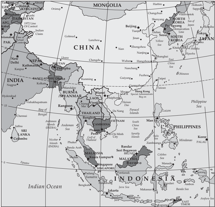
Southeast Asia (redrawn from a map produced by the U.S. Central Intelligence Agency in 2004)