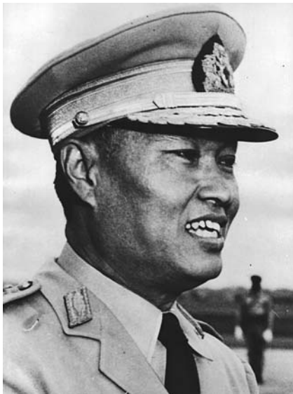
General Ne Win (1911–2002), the first military commander to be appointed as prime minister of Burma (Myanmar).