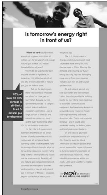
Figure 5-1: A minimalist approach is generally more appealing to customers from high-context cultures.