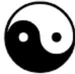
Figure 1. The Chinese symbol of the Supreme Ultimate, commonly referred to as the yin-yang symbol, in which the dark (yin) and the bright (yang) are dynamically interrelated. Each contains the seed of the other (the black spot in the white area and the white spot in the black area).

The Chinese terms yin and yang originally (eighth to fifth centuries BCE) referred to ‘a hillside in shade’ and ‘a hillside in sunlight’. However, they quickly acquired a wider range of dualistic associations: dark and light, moist and dry, earth and heaven, passive and active, female and male, supple and strong, low and high, follower and initiator. In philosophical thought, they came to stand for the primary pair of complementary opposites within the Supreme Ultimate (see Figure 1). In yin-yang theory, all