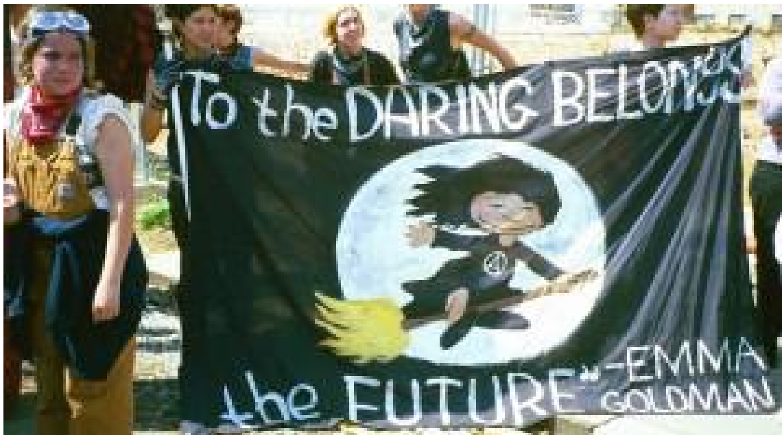
Anarcha-feminists at an anti-globalization rally and protest quote Emma Goldman

But even more striking is the conceptual convergence with the conception of freedom that I have described above. For instance, Kornegger affirms that "liberation is not an insular experience" because it can occur only in conjunction with all other human beings (ibid., 496), which, again, means that freedom cannot but be a freedom of equals. However, this also implies that one cannot fight patriarchy without fighting all other forms of hierarchy, be they economic or political. As Kornegger (2007:493) again put it, "feminism does not mean female corporate power or a woman president: it means no corporate power and no president."