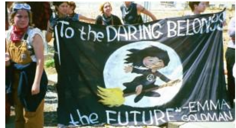
Anarcha-feminists at an anti-globalization rally and protest quote Emma Goldman

But even more striking is the conceptual convergence with the conception of freedom that I have described above. For instance, Kornegger affirms that "liberation is not an insular experience" because it can occur only in conjunction with all other human beings (ibid., 496), which, again, means that freedom cannot but be a freedom of equals. However, this also implies that one cannot fight patriarchy without fighting all other forms of hierarchy, be they economic or political. As Kornegger (2007:493) again put it, "feminism does not mean female corporate power or a woman president: it means no corporate power and no president."