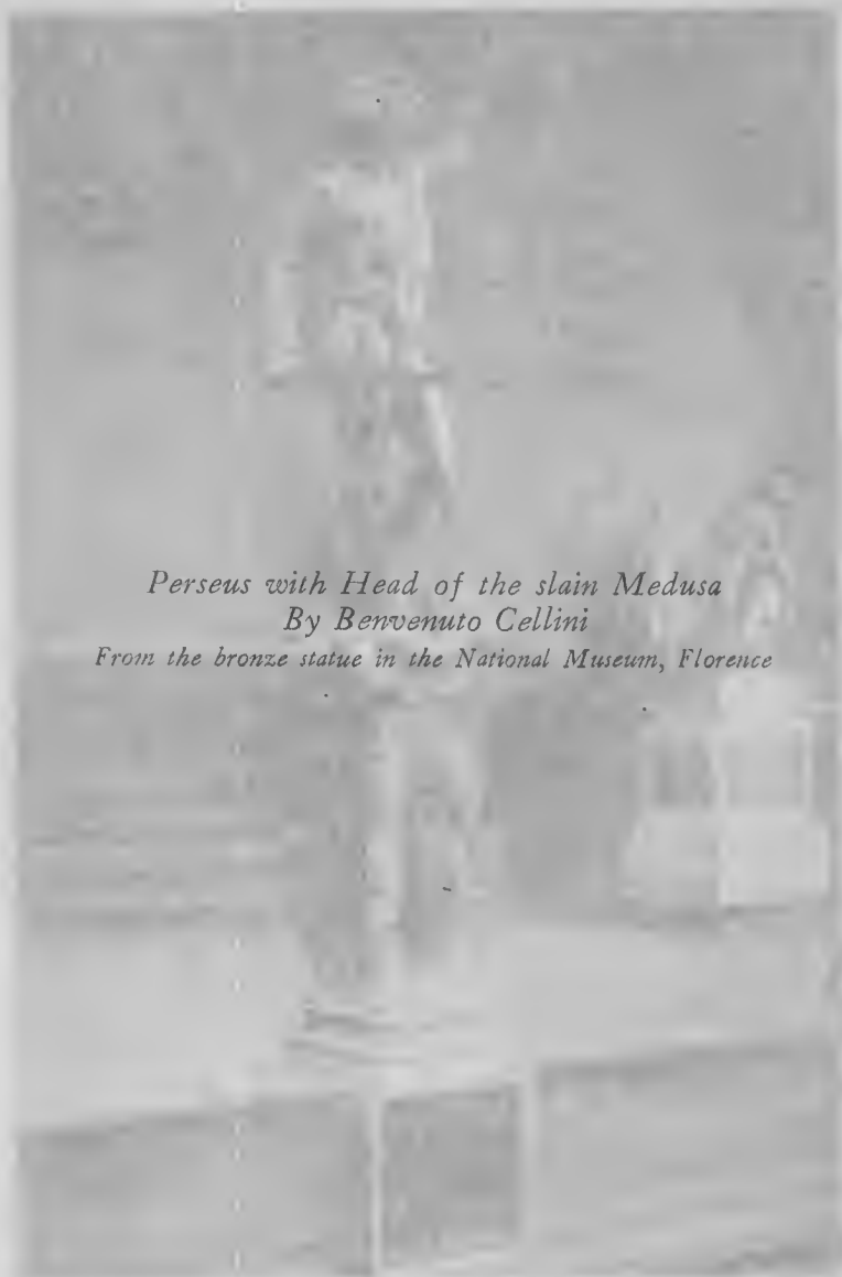
Perseus with Head of the slain Medusa By Benvenuto Cellini From the bronze statue in the National Museum, Florence