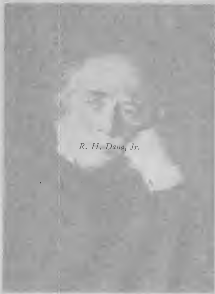
R. H. Dana, Jr.