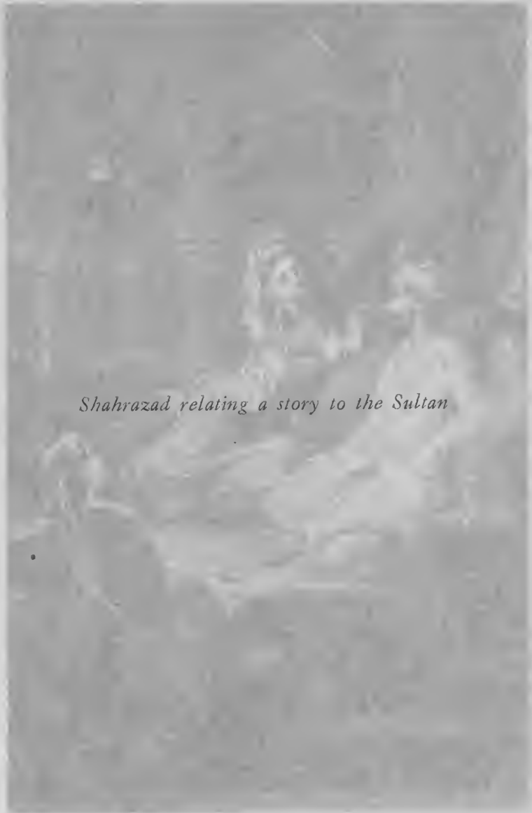
Shahrazad relating a story to the Sultan